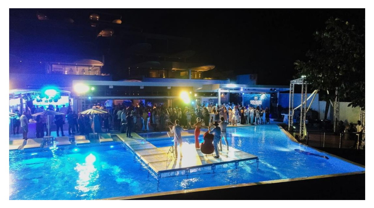
The spectacular opening party, guests enjoyed award-winning cuisine and world-class entertainment