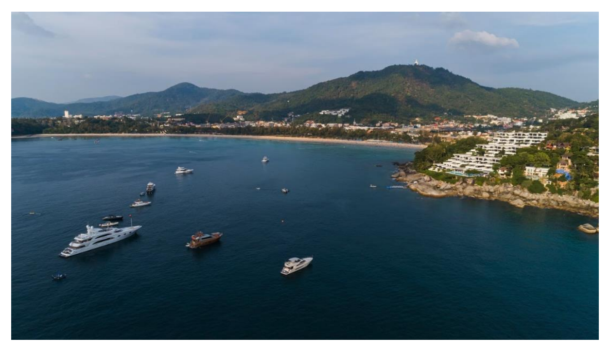
Spectacular Line-up of participating superyachts