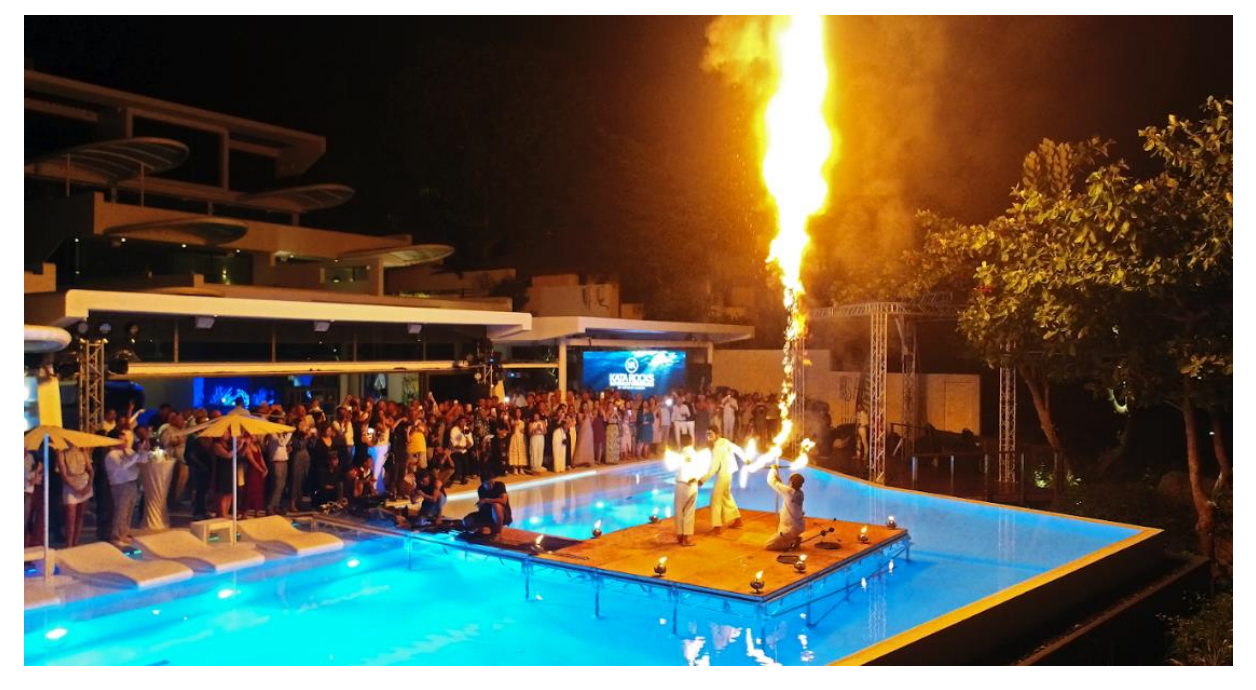
Spectacular fire show & performance during the opening party of the KRSR 19