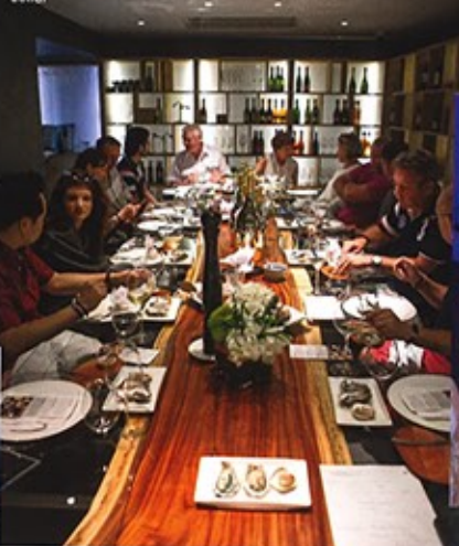
Rendezvous guests enjoy a wine and oyster pairing in the Kata Rocks cellar