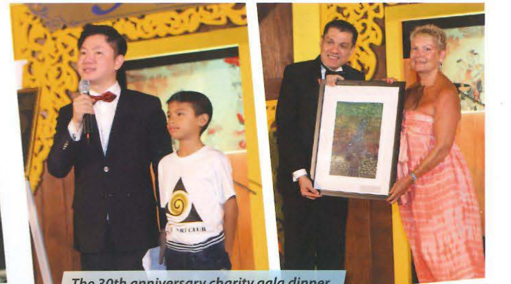
The 30th anniversary charity gala dinner @ Dusit Thani Laguna