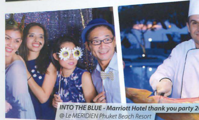
INTO THE BLUE - Marriott Hotel thank you party 2017 @ Le MERIDIEN Phuket Beach Resort