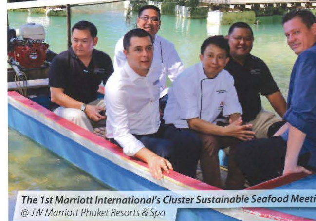
The 1st Marriott International's Cluster Sustainable Seafood Meeting @ JW Marriott Phuket Resorts & Spa