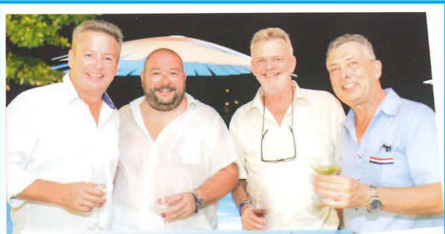
Kata Rocks Superyacht Rendezvous opening party