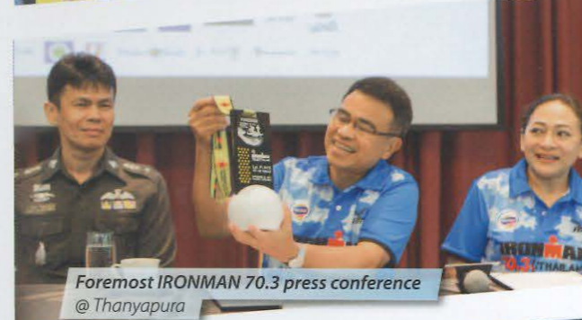
Foremost IRONMAN 70.3 press conference @ Thanyapura