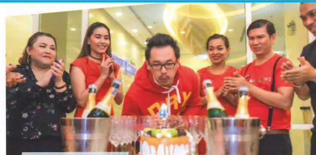
4th years anniversary Sleep With Me design hotel Patong