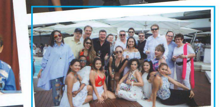
Kata Rocks celebrates 3rd anniversary