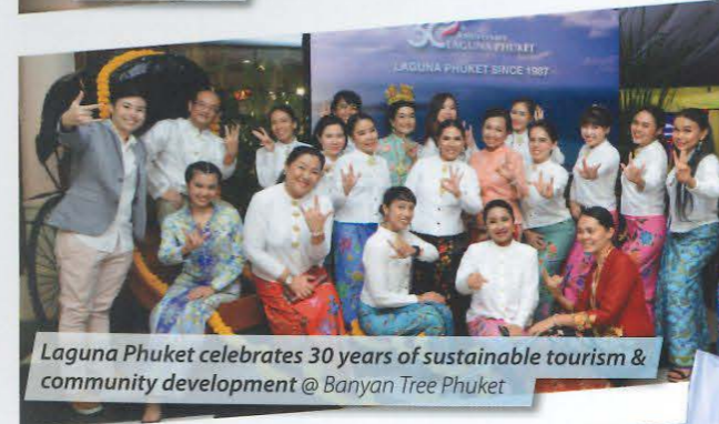
Laguna Phuket celebrates 30 years of sustainable tourism & community development @ Banyan Tree Phuket