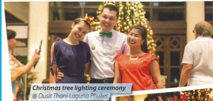
Christmas tree lighting ceremony @ Dusit Thani Laguna Phuket