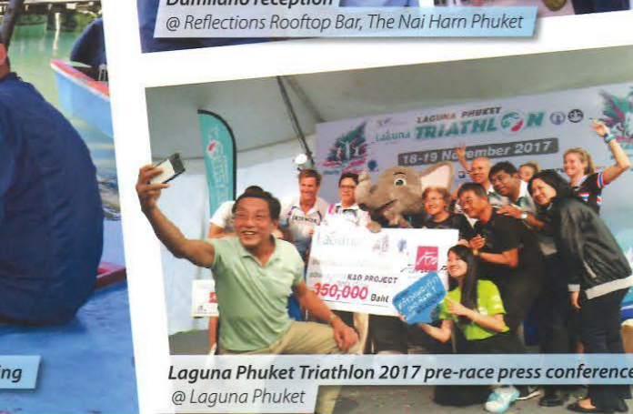
Laguna Phuket Triathlon 2017 pre-race press conference @ Laguna Phuket