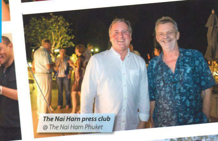
The Nai Harn press club @ The Nai Harn Phuket