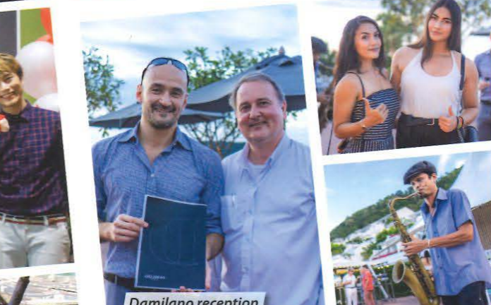
Damilano reception @ Reflections Rooftop Bar, The Nai Harn Phuket