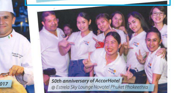
50th anniversary of AccorHotel @ Estrela Sky Lounge Novotel Phuket Phokeethra