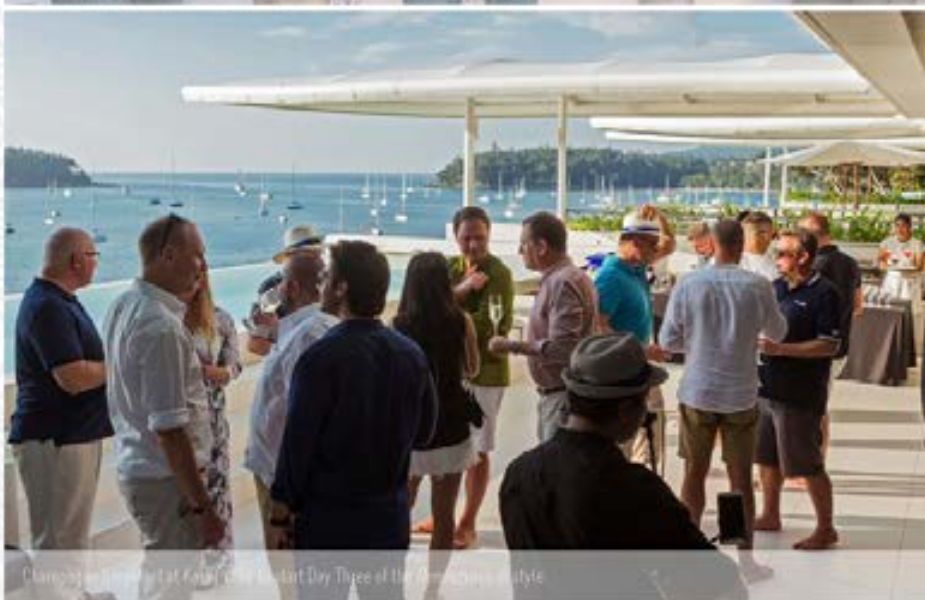
Champagne toast at Kata Rocks' last day Three of the Rendezvous style

included Feadship's 70-metre MY Lady Christine that showcased a radically different exterior design from De Voogt Naval Architects; the 52-metre Phinisi Schooner SY Zen , Burgess' 51-metre MY Northern Sun , 32-metre MY Princess Sauvage , two Monte Carlo 86 yachts and MY Grace , the 2017 Sunseeker Manhattan 66.