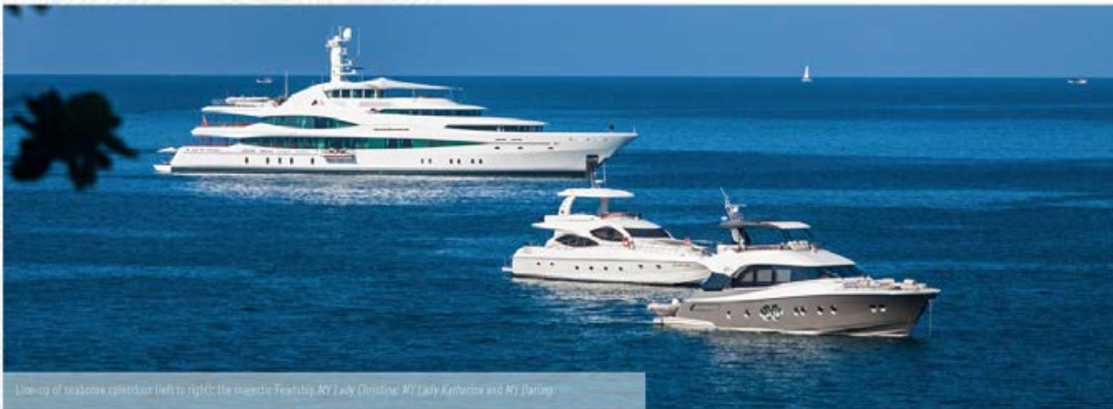
Line-up of seabone calendar (left to right): the majestic Feadship MY Lady Christine, MY Lady Katherine and MY Darling