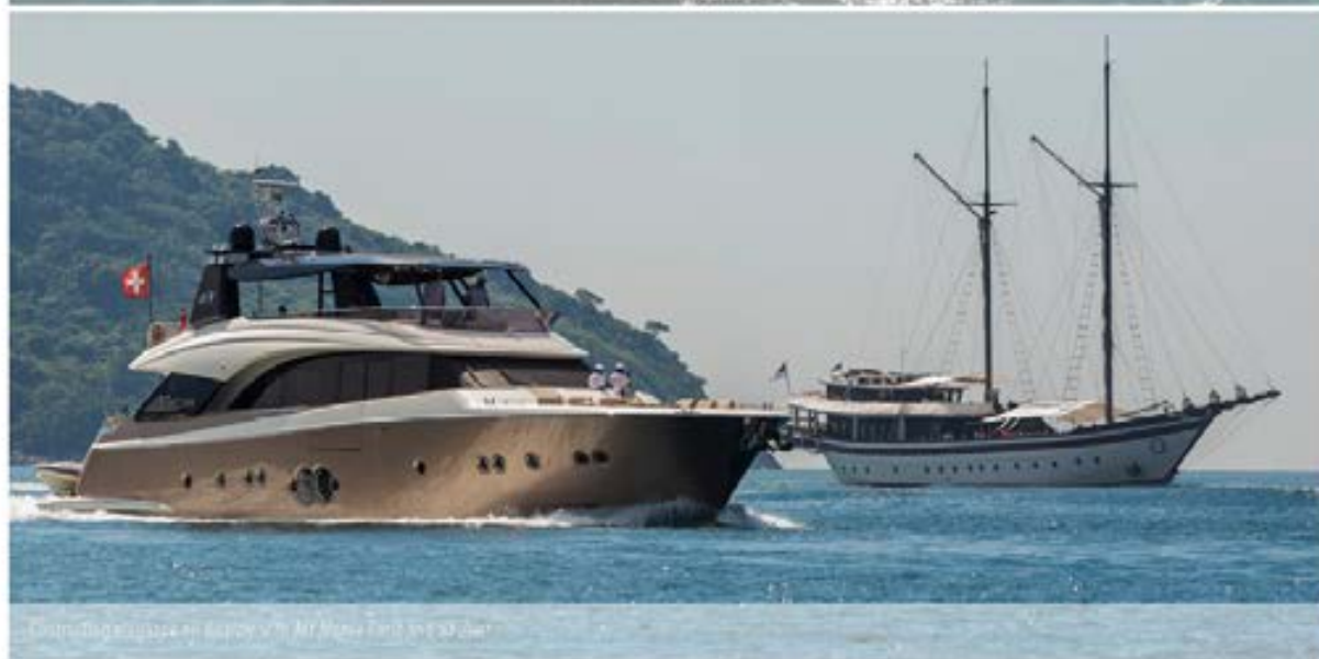
Contrasting styles of luxury yachts, MY Mega Fortis and MY Jolie