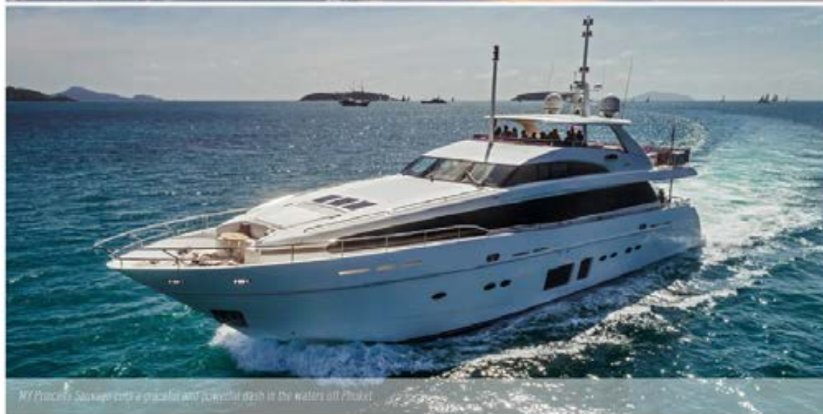
MY Princess Sauvage on a graceful and powerful dash in the waters off Phuket