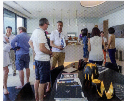
Organised by Phuket-based Infinite Luxury, the rendezvous was an invitation-only event