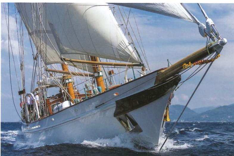
Traditional sail power in a modern style returns to Phuket