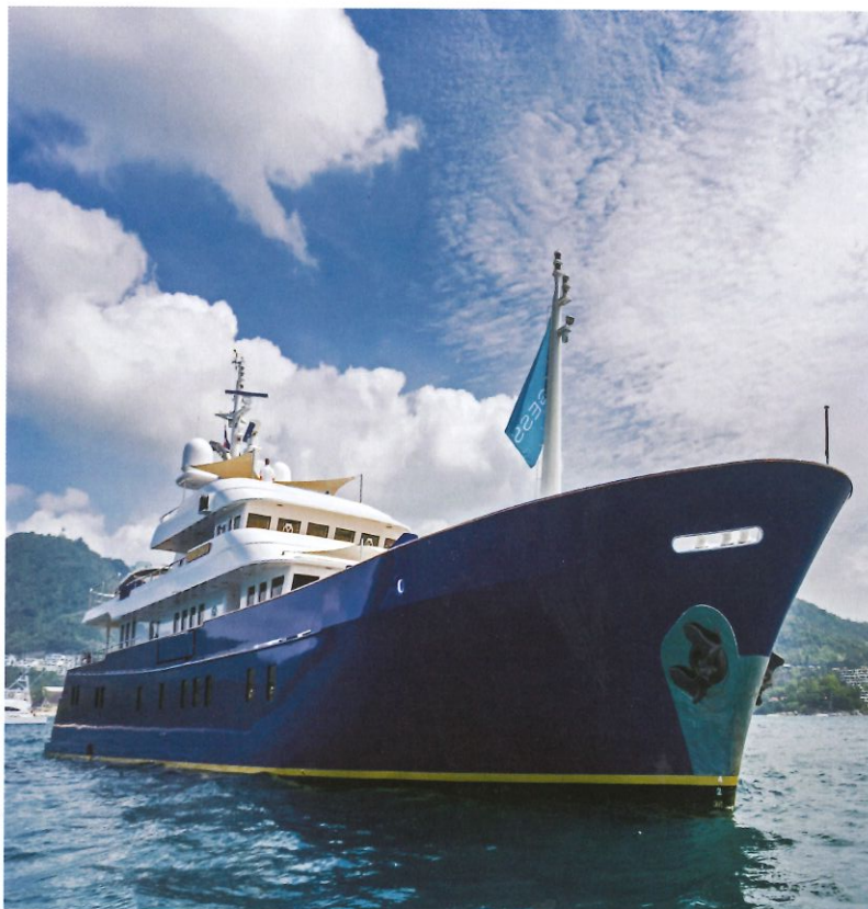
The character of this classic motor yacht is evident

prestige of the Kata Rocks Superyacht Rendezvous and its dynamic synergy between superyachts, luxury villas and private jets, a new participant this year is Vista Jet, one of the world's most innovative private jet companies.