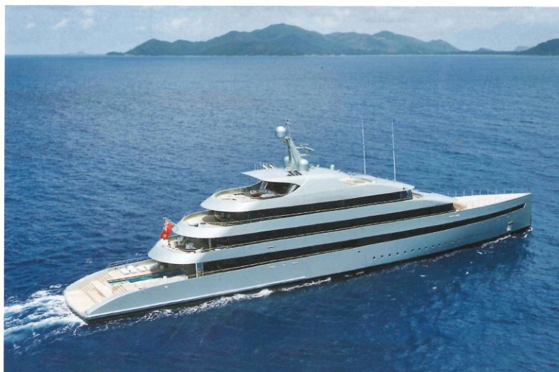
The spectacular sight of huge superyachts at anchor will enhance the waters off Kata Rocks