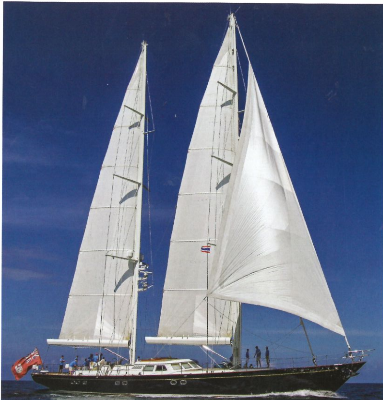
This sleek, low-hulled craft boasts a powerful presence at sea