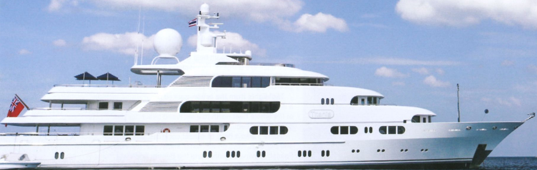
Seagoing splendour on show at the Kata Rocks Superyacht Rendezvous