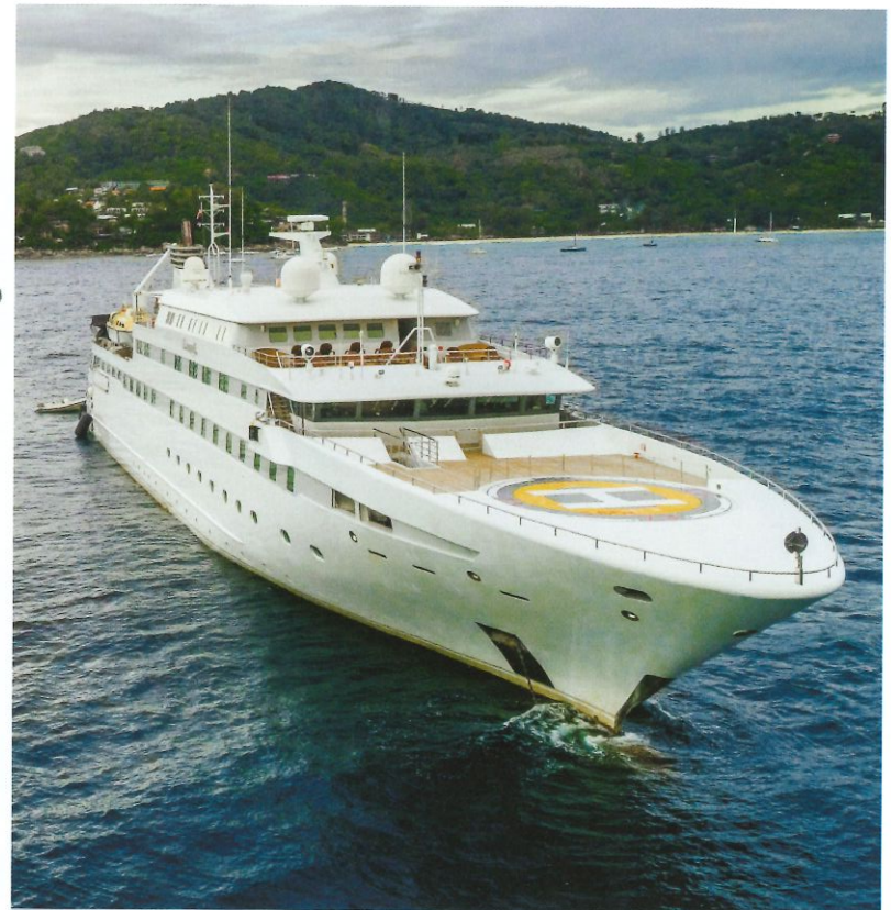
A floating luxury palace, complete with helipad