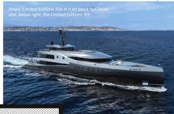
Amels' Limited Editions 206 in a jet black hull finish and, below right, the Limited Editions 199